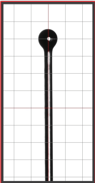
Fully Processed Ball Lens

Real time image processing allows the user to view the lensing of a fiber in process. When lensing process is completed, the user is automatically alerted of pass/fail status based upon program specific criteria.