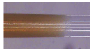
Polyimide stripping: Polymicro 330/300 μm, Polyimide coating shown.